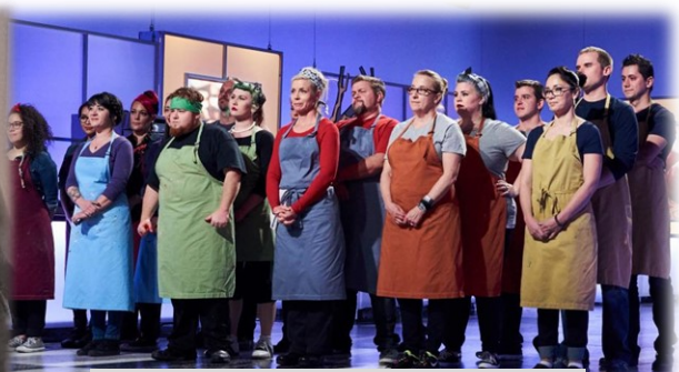
HGTVs Halloween Wars Season 7 competitors