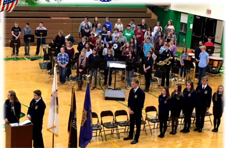
SHS FFA Members, along with our Choral & Band Members, all rise as our local veterans and American Legion Auxiliary members are introduced during the 2017 Veterans Day Assembly.