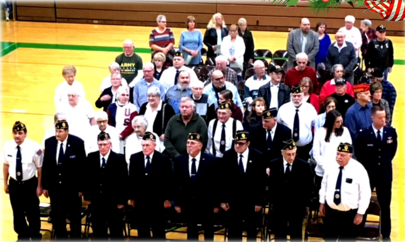
Local area veterans and the American Legion Auxiliary members are thanked by all in attendance with a standing ovation. Most all of these veterans have been attending this SHS school assembly since it began.