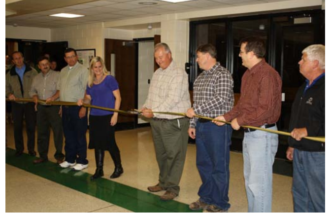
Seneca High holds Educational Open House